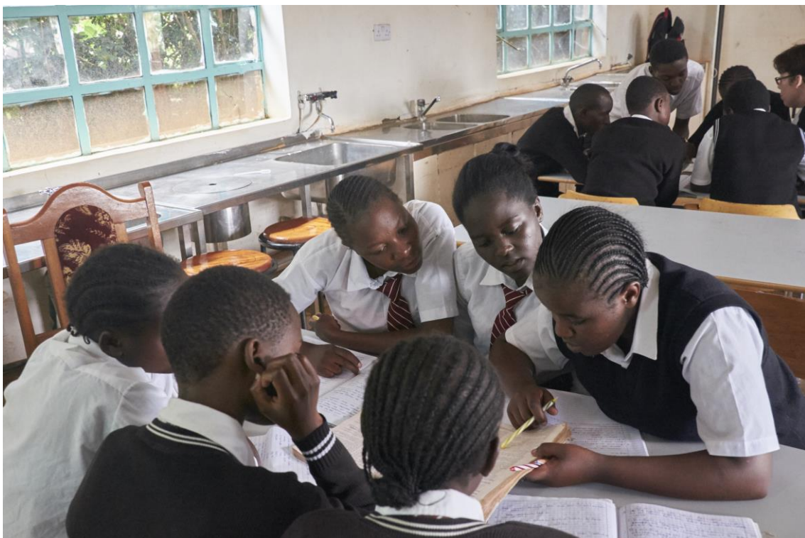
Pågående lektion och gruppdiskussioner på Kenswed

Distribution av vatten till boende i närområdet har påbörjats. Därmed är skolan nu delvis självförsörjande!