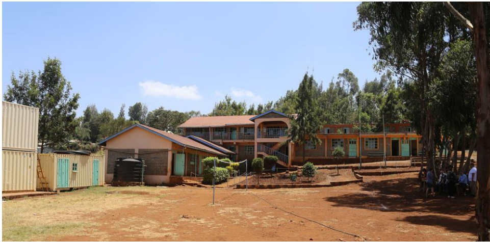
Skolan i dagsläget med nybyggna längst till höger

Skolan har expanderat mycket senaste tiden. De senaste byggnationerna är personalrum, rektorsrum, mottagningsrum och musikstudio. Utöver mödravårdskliniken planeras det även att bygga på en våning på internatet, samt ett nytt klassrum ovanpå det nybyggda personalrummet. Även ett guest house kommer byggas på området ovanför skolan.