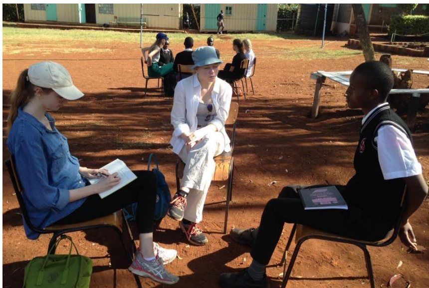
Diskussioner mellan elever från Berzeliusskolan och Kenswed

I januari fick Kenswed besök av studenter från Berzeliusskolan i Linköping. Bland annat diskuterades avfallshantering, HIV och levnadsstandard. En annan grupp studenter från Göteborgs Universitet besökte skolan i januari. Mer om det längre ner i nyhetsbrevet. Ytterligare en grupp studenter från KTH är där och undersöker biogasen som används till köket. Syftet är att se om gasen kan användas även till odlingar.